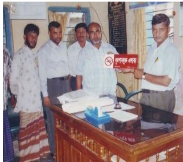
Leaflet campaigning in front of DC Office Smoking free sign being inaugurated by UP Chairman