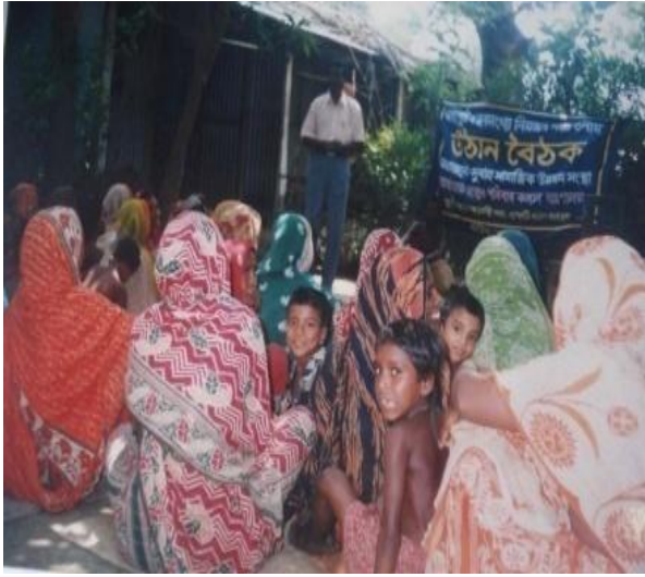
Yard meeting on Health, Nutrition and population control held.