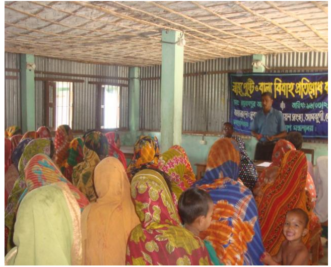
Civil Surgeon, Meherpur distributing better food.

According to the plans seminar on health, nutrition and population control are organized at the training center of Subah SamajikUnnayanSangstha. It is attended by representatives of governmental and non-governmental organizations, dignitaries of the area and a fixed number of grassroots women and men. Regular seminars and outreach meetings are conducted by the specialist doctors to increase the health nutrition and population awareness of the participants in the seminar.